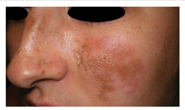
Figure 3: The histopathological findings, laboratory and clinical characteristics.

the acneiform presentation was confirmed. Treatment with Isotretinoin 0.75 mg/kg/day during 5 months, contraception, and sunscreen were indicated. In the clinical control, the patient had a noticeable improvement, which was demonstrated by the reduction of erythema, infiltration, number of comedones, and the disappearance of the scales (Figure 3).