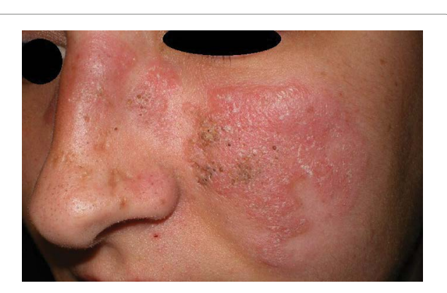
Figure 1: The patient experienced photosensitivity.

With the histopathological findings, laboratory and clinical characteristics, the diagnosis of CCDLE with